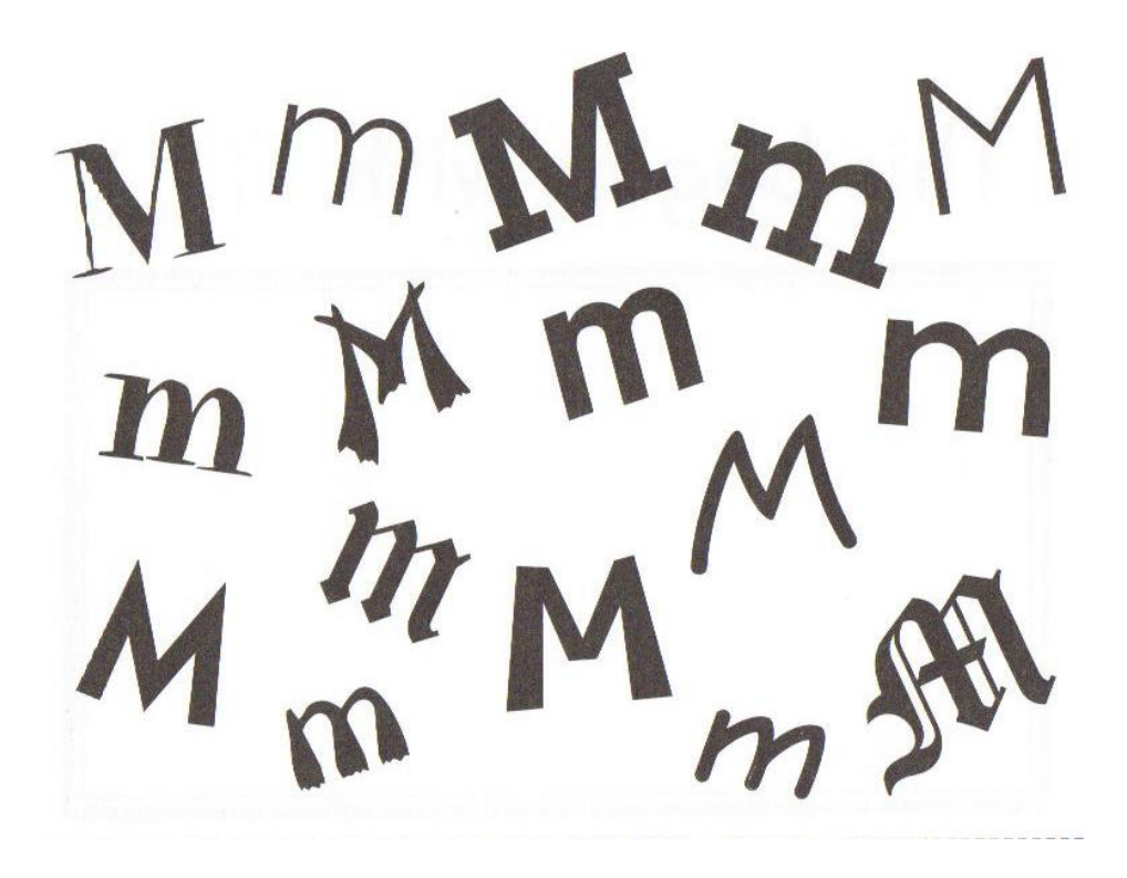
My Book of Letter