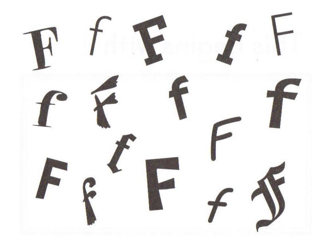
My Book of Letter F